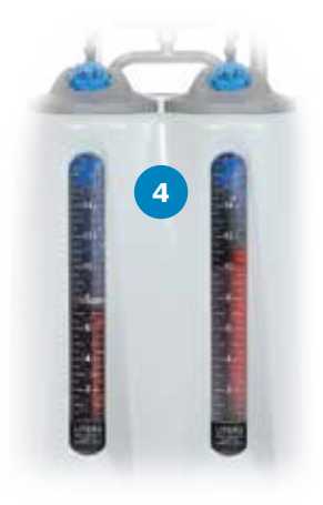
Reservoir windows with lights on/tint off